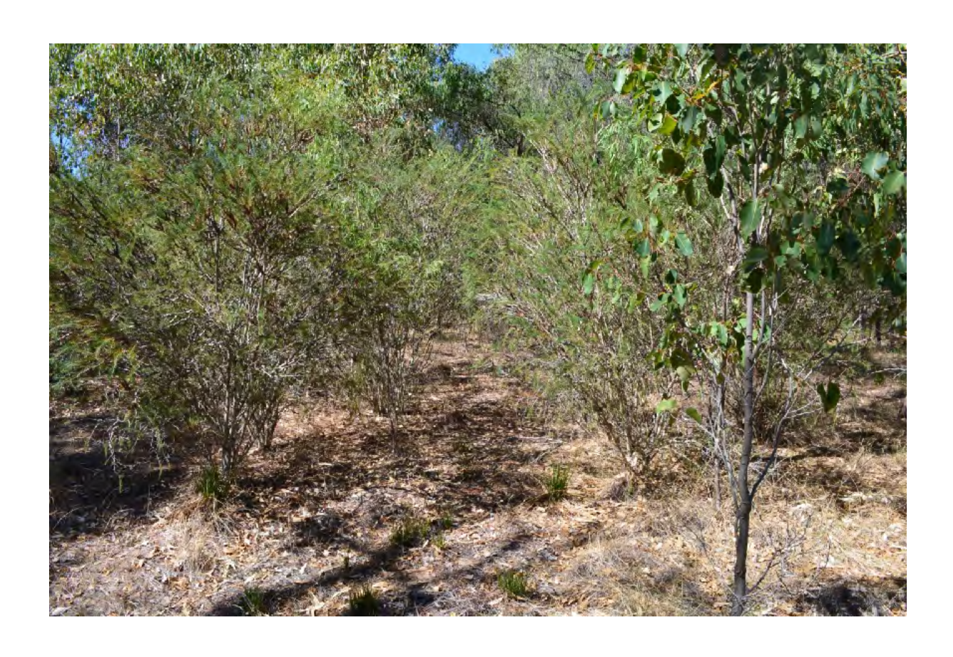
Plates 1 and 2: Midstorey vegetation within the 'revegetation' area