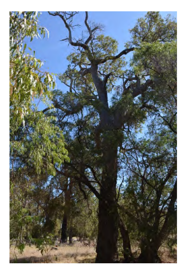
Plates 3 and 4: Upper storey vegetation within the 'revegetation' area