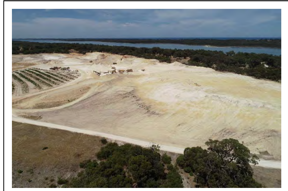
Plate 1 : Aerial overview of the project looking west towards Lake Preston.