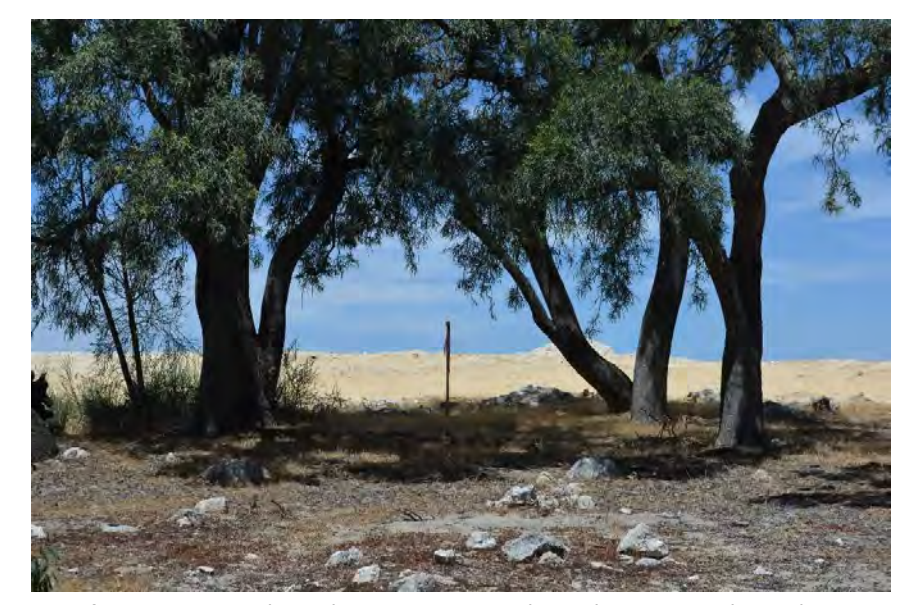
Plate 3 : Peg marking the project area along the western boundary.