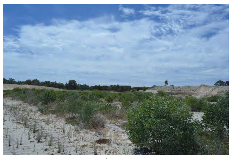
Plate 2 : Revegetation within pit for previous state approval compliance.