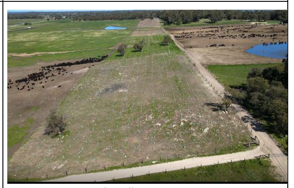
Plate 4 : Revegetation of the Offset Area in winter 2021, looking south.